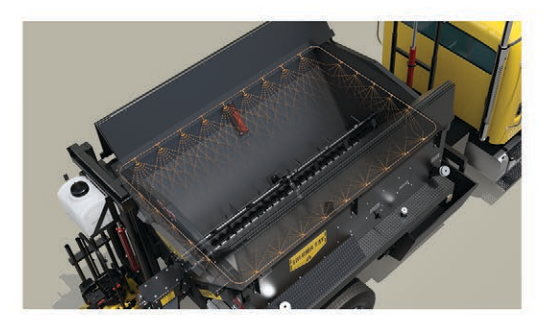
Release agent spray bar coats hopper to prevent asphalt from sticking, so crews don't have to climb truck or enter hopper.