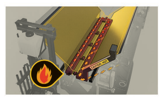
Radiant oil heating maintains asphalt and tack tank temperature with superior consistency and uniformity.